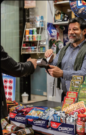
PLUS For Outdoors