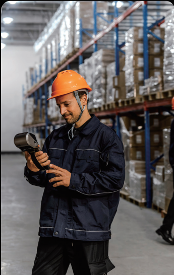
PLUS For Manufacture