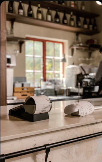
PLUS For Takeout